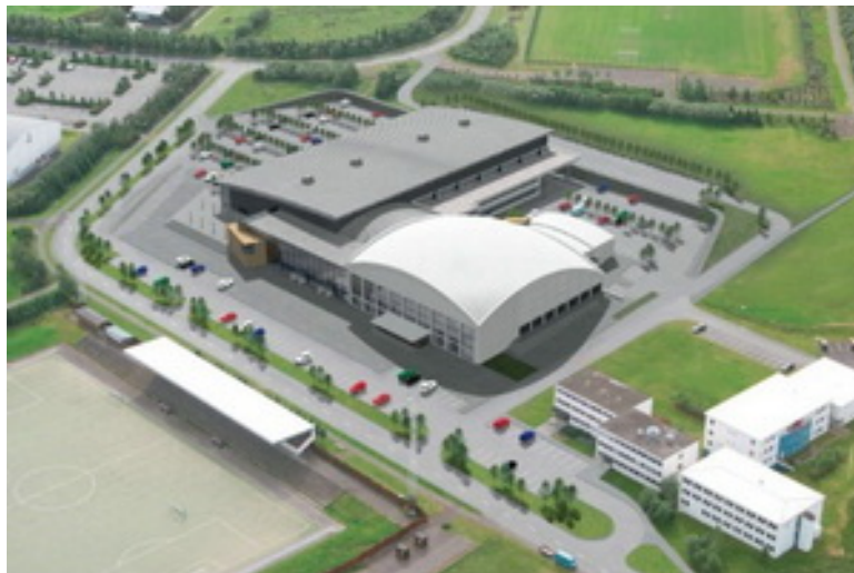
Iceland Sport Center , Engjavegur 6, 104 Reykjavík

Laugardalshöll, Competition Venue ( http://www.ish.is/ )